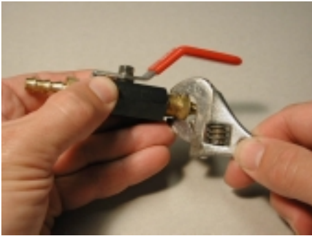
Installing the barb fittings on the ball valve.

6. Screw the two barb fittings into the body of the ball valve. Tighten with the adjustable wrench.