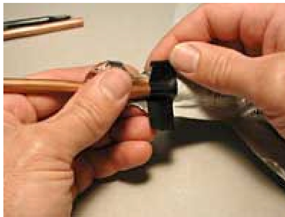
Taping the neck.

4. Securely tape the neck of the balloon to the tube as shown in the illustration.