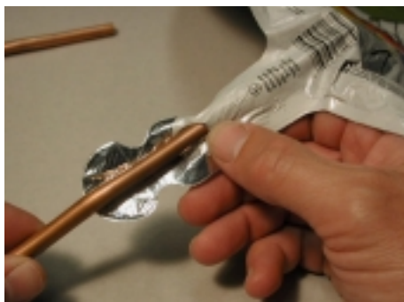
Inserting copper tubing.

2. The Mylar balloon has a sleeve-like valve that prevents helium from escaping once it is filled. This sleeve will help form a leak-proof seal around the rigid tubing. Push the tubing into the neck of the balloon, past the end of the sleeve, leaving about 2cm protruding from the neck of the balloon, as shown below.