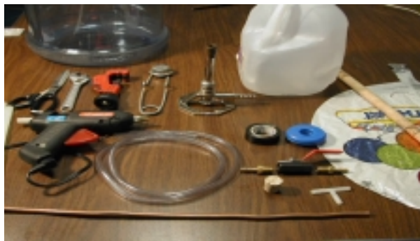
The materials and tools you'll need to build a biogas generator.