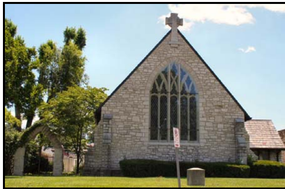
ST. PAUL'S EPISCOPAL CHURCH