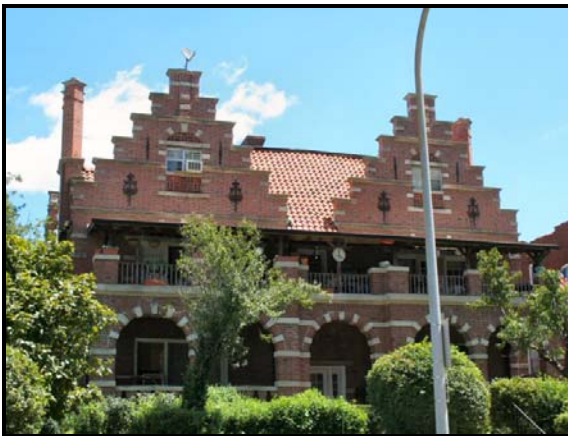
MATTIE JOHNSON APARTMENT BUILDING

The area is roughly bounded by Loughborough Avenue on the south, Holly Hills Avenue on the north, Broadway on the east and Idaho Street on the west. The area is primarily residential.