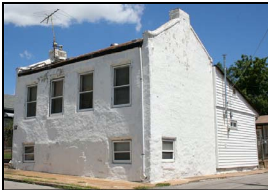
117 LOUGHBOROUGH – C. 1860