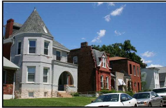
STREETSCAPES IN THE PROPOSED DISTRICT