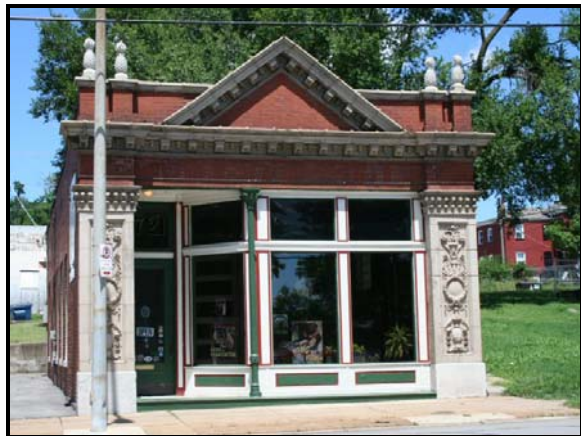
6721 S. BROADWAY – COMMERCIAL BUILDING