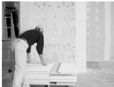
Many crews speed up the stacking by building a simple two-sided, free-standing frame. Note: Frame is not attached to pallet.